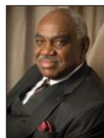
Hon. U.W. Clemon

Sponsored by the Environmental Law Section