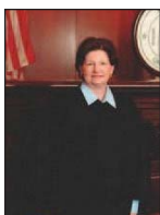
Hon. Lyn Stewart