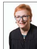
Hon. Caryl P. Privett