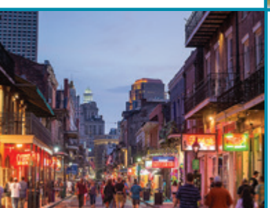
March 14-15, 2019 Sheraton New Orleans New Orleans, LA