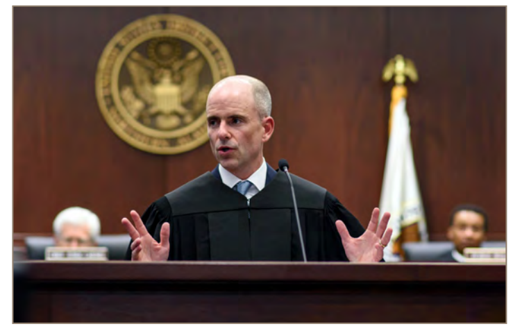
Judge Newsom said: "I feel like I've hit the professional jackpot." (Eleventh Circuit Court of Appeals)