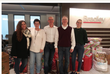
Patriot Military Family Foundation Gift Drive CHARLOTTE