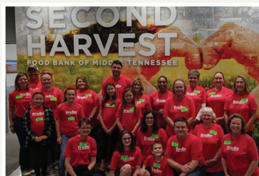
Second Harvest Food Bank of Middle Tennessee Family Night NASHVILLE