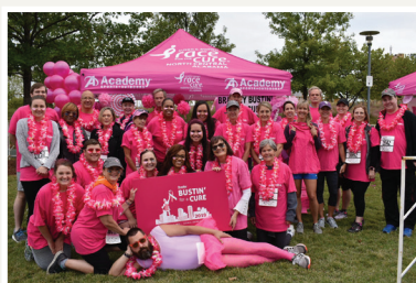
Susan G. Komen Race for the Cure BIRMINGHAM