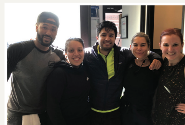
Leukemia and Lymphoma Society District Climb Race to Everest Base Camp DALLAS