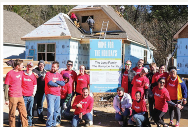
Habitat for Humanity Home for the Holidays Build BIRMINGHAM