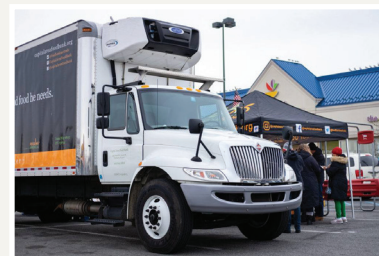
Capital Area Food Bank Donation Drive WASHINGTON, D.C.