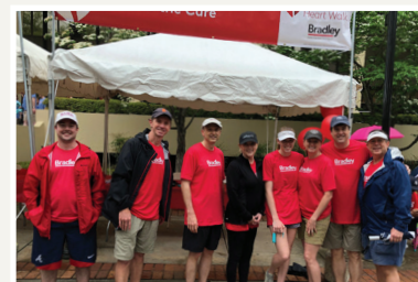
American Heart Association Heart Walk HUNTSVILLE