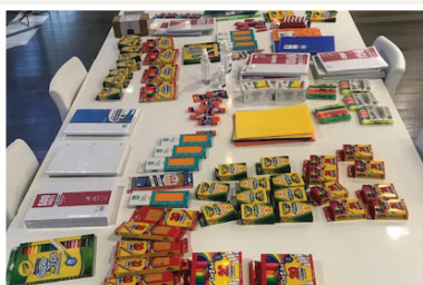
The Salvation Army School Supply Drive JACKSON