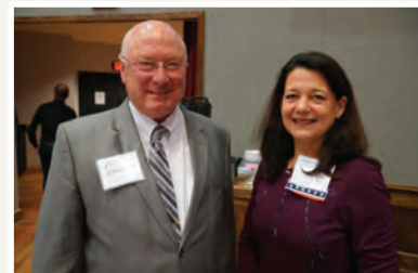
Middle Tennessee Legal Aid Society Breakfast of Champions NASHVILLE