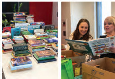
Classroom Central Powerful Pages Community Book Drive CHARLOTTE