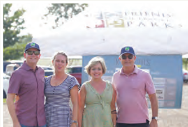
Friends of Franklin Parks Raise the Roofs NASHVILLE