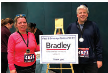
Montgomery County Bar Association Race Judicata MONTGOMERY