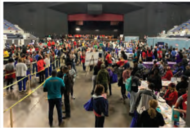
One Roof Alabama Homelessness Outreach Project BIRMINGHAM