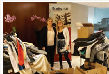
A Wider Circle Clothing Drive WASHINGTON, D.C.

For more information, visit our website at bradley.com/foundation