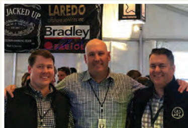
Houston Livestock Show and Rodeo World Championship Bar-B-Que Contest HOUSTON