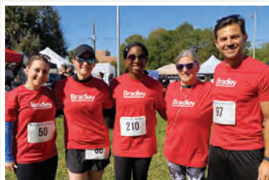
Hillsborough County Bar Association 5K Pro Bono River Run TAMPA