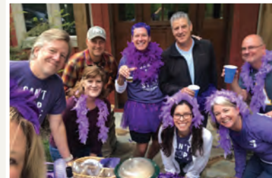
Isabella Santos Foundation 5K Run CHARLOTTE