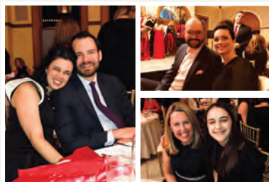
JPS Health Network Rhythm and Romance DALLAS